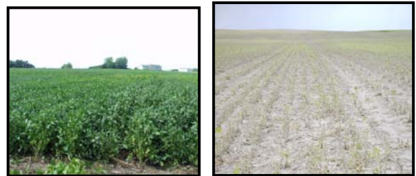
Figure 1A, healthy soybeans and Figure 1B, soybeans destroyed by hail, Britton, SD, 07/04/03.

To document after storm damage, the 'after picture' should be collected as soon as possible after the storm. This may be important because depending on storm extent and number of claims, plant re-growth may occur before the hail adjuster arrives.